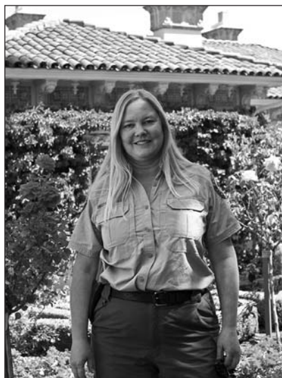
LEFT: ‘Climbing Cécile Brunner’

Looking ahead, Christine envisions a time when the large oaks along the north side of the Esplanade will die out. “It’s a whole circle of life. There used to be rose stan-