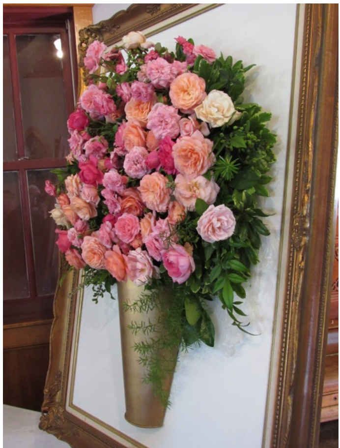
3-D "painting" of live roses, by Henry Flowers