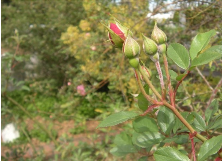
'Fun Jwan Lo' buds.