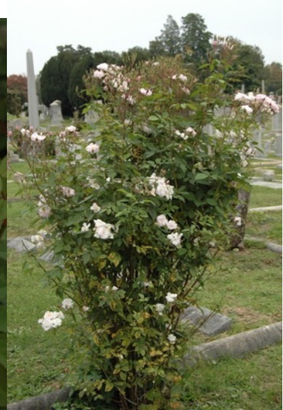
Noisette rose, identity unknown, on the Lyons lot in Hollywood Cemetery

Share your extra plants. Whether you have surplus plants from propagation, or are removing and replacing roses in your garden, pass these along to other gardeners. In my home rose society, members bring plants like these to meetings, and we auction them to benefit the society's treasury.