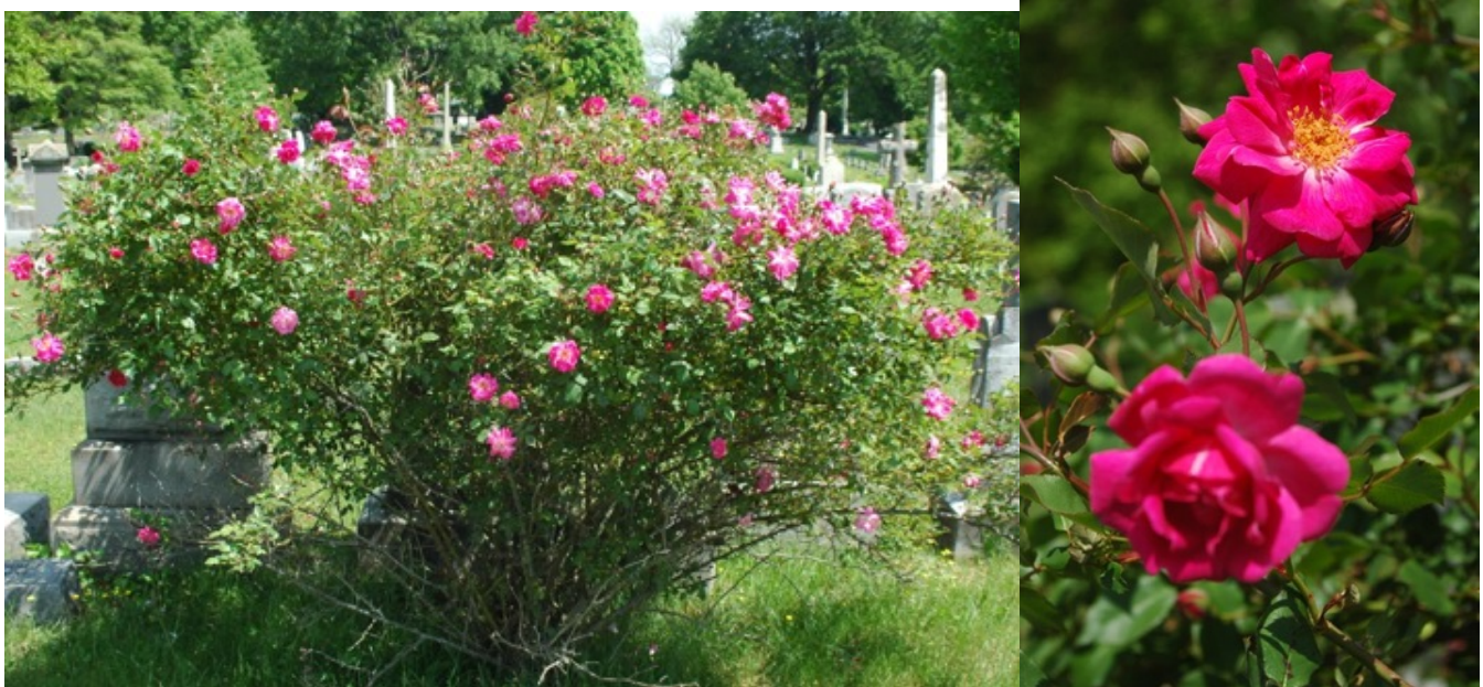
Noisette (China?) rose, believed to be 'Fellemborg', on the Williams/Gemmell lot in Hollywood Cemetery

Threats to roses have always existed. Fashions change, new roses are introduced, and older roses may be discarded. Roses in historic locations can be under threat from redevelopment, ignorance, or the careless use of lawn equipment and herbicides. Pests like chilli thrips and diseases like rose rosette disease can threaten the very existence of our rose gardens.