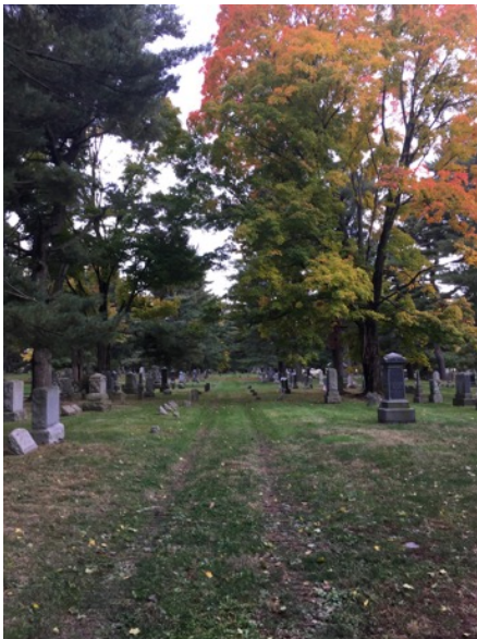
View of the historic cemetery