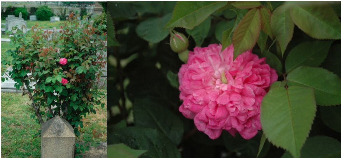
The Hybrid China, identity unknown, on the Lyons lot at Hollywood Cemetery

In my travels, I often make time to visit local historic sites and cemeteries. In the cemeteries, I am fascinated by the regional differences in burial customs, monuments and art, and by the plants that are there. When I find roses, I often take cuttings and document them as well as I can. These roses are part of the heritage of the place, and I feel that it is important to preserve them. Some of the roses that I collected have disappeared from their original site. They live on in my garden, and in the gardens of others that I shared them with.