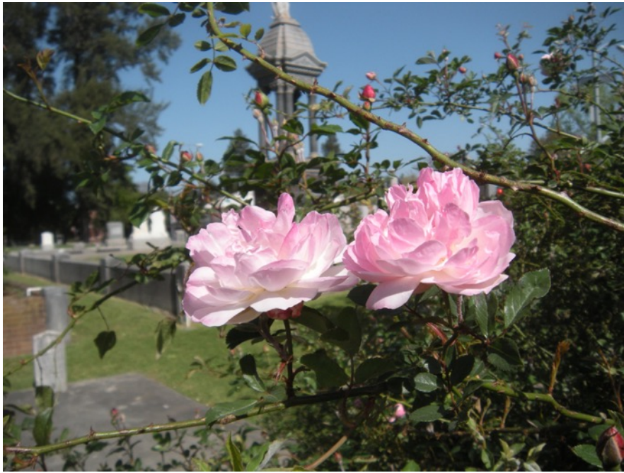
'Fun Jwan Lo'.