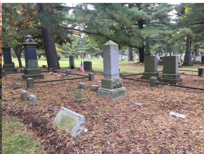
Elmwood Cemetery, ready for planting

The board has decided that the best way to encourage our mission of preservation and education is to assist individuals and groups with grants who are actively working to save old garden roses. We will be creating criteria for future grants and will publish this for our members on our website.