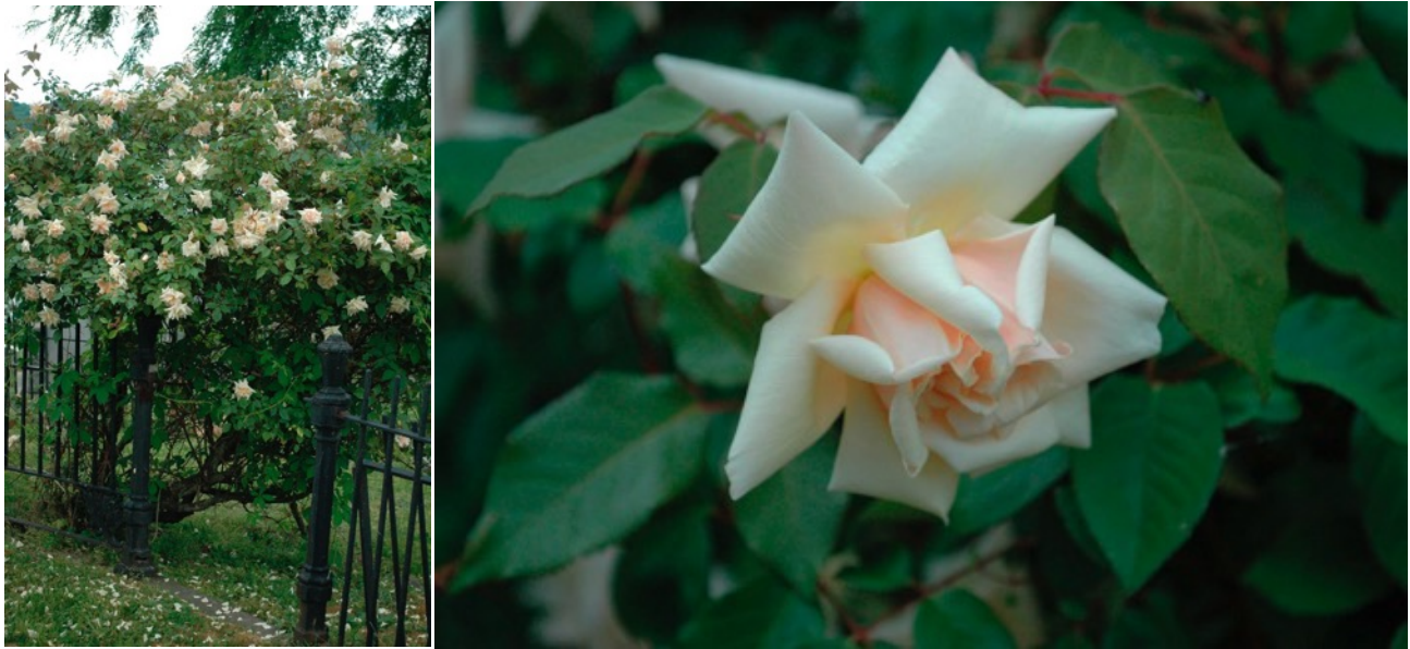
Tea rose, believed to be 'Safrano', on the Waller/Smith lot in Hollywood Cemetery

Expand rose show schedules to encourage entries that will include more types of roses and participation by more rose growers. In addition to categories for modern, exhibition-style Hybrid Tea, Floribunda, Miniflora, and Miniature roses, many rose shows include classes to enter Polyanthas, non-exhibition Hybrid Teas, found roses, organically-grown roses, climbers, and multiple categories within the old garden rose classes. Some rose shows also feature non-judged displays that showcase old and new roses that grow well in the society's area.