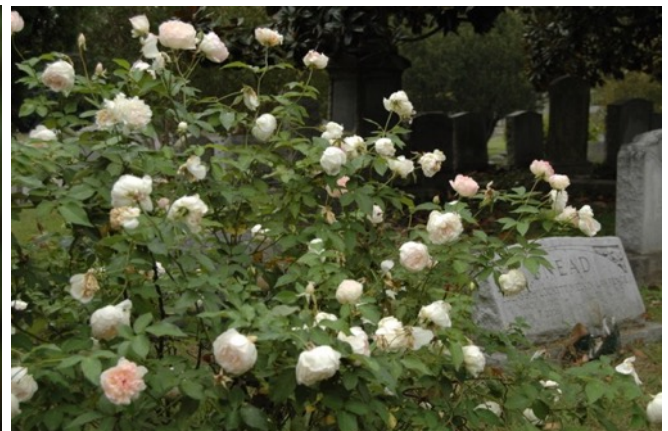
Tea rose, believed to be 'Mme. Joseph Schwartz', on the Snead lot in Hollywood Cemetery