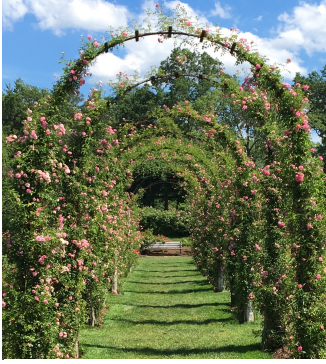
Dorothy Perkins arches in Elizabeth Park.

TBA: Elizabeth Park Rose Garden: Pruning workshop in either late March or early April with a focus on heritage roses, including climbers and ramblers. Details to be posted on our website and facebook page.