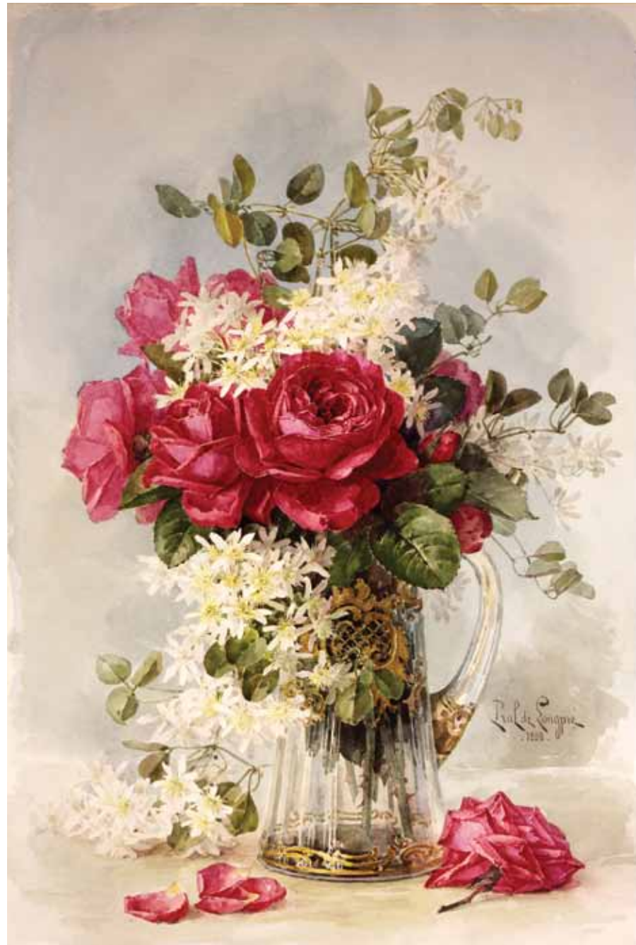
Fresh from the Garden, watercolor, 22 × 15 in.