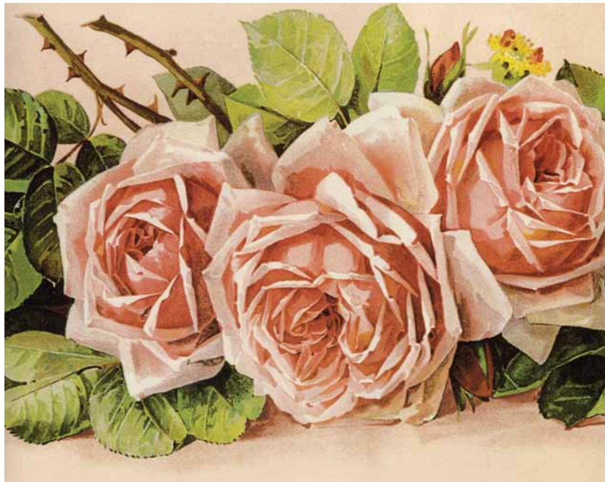
RIGHT: Last Rose of Summer, chromolithograph