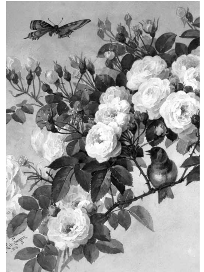
Detail from Wild Roses , watercolor, 15 × 24 in., 1898