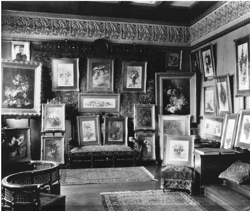
The formal gallery of the Longpré mansion in Hollywood, California